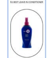
It's a 10 Miracle Leave-in Product

It's so much more than just a leave-in conditioner. It detangles, gives hair softness and shine, helps repair damage and split ends, minimizes flyaways, and makes styling way easier. It's no surprise 1,000 of you said it's the leave-in conditioner you "never let"