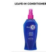
It's A 10 Miracle Leave-in Product

It's A 10 Haircare's leave-in spray with strengthening silk amino acids has earned its cult classic status thanks to multiple benefits in one: detangling, softening, smoothing, protecting and shine-enhancing. TESTER NOTE: "I love that this eliminates the need to use so many products and even provides heat protection for styling." LAB RESULTS: The formula is effective at keeping hair smooth yet has a light texture. Beauty Lab experts found.